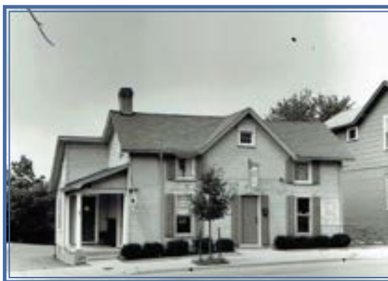
63 W. Franklin with 57-59 to the right c late 1900's

In the end, the two houses were conjoined into one. About 2022, they began a new life together as Manna, a restaurant, holding the history of so many lives within the walls.