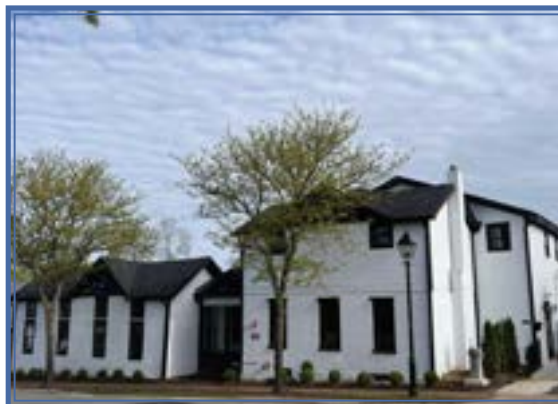
Manna joins 57-59 (right) and 63 (left) W. Franklin into one restaurant c 2022

Thank you to our Business Members Solid Rock Roofing • Tinnerman Insurance Agency Tri Level Productions